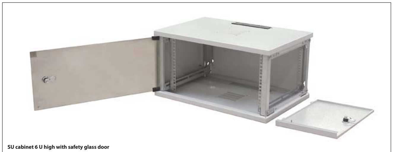
SU cabinet 6 U high with safety glass door