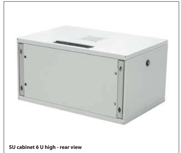
SU cabinet 6 U high - rear view