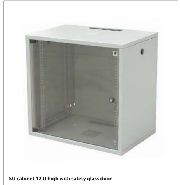
SU cabinet 12 U high with safety glass door

Cabinets are packed in cardboard boxes. In the packing there is a template for drilling holes in the wall.